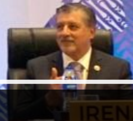
The launch of the 5 th ASEAN Energy Outlook with the Philippine Secretary of Energy, Alfonso G. Cusi, 28 September 2017.