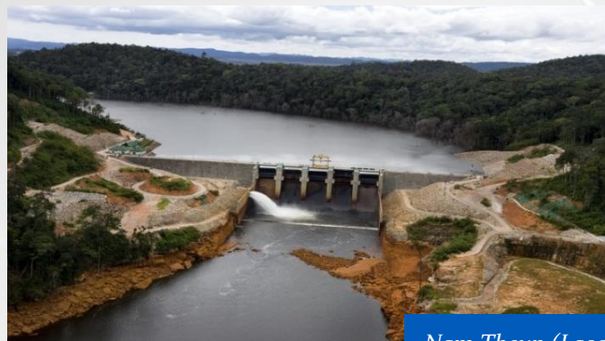
Nam Theun (Laos)