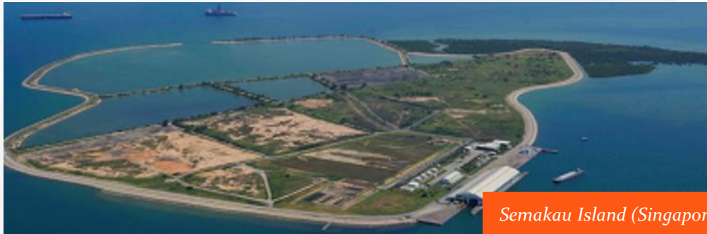
Semakau Island (Singapore)

Today, 15% of the World population doesn't have access to electricity