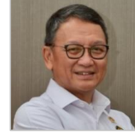
H.E. Arifin Tasrif

Minister for Energy and Emissions Reduction Australia