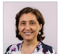
The Hon. Lily D' Ambrosio MP

Secretary of State for Business, Energy and Industrial Strategy United Kingdom