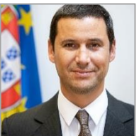
H.E. Dr João Galamba

Minister for Energy, Environment and Climate Change, Minister for Solar Homes Victoria Australia