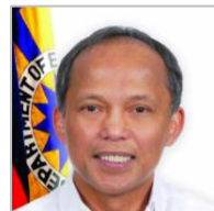
H.E. Alfonso G. Cusi

Minister of Energy and Resources New Zealand