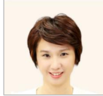
Low Yen Ling

Minister for Manpower and Second Minister for Trade and Industry Singapore