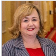
The Hon. Dr Megan Woods

Deputy Minister for Energy and Mines Laos People's Democratic Republic