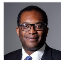
The Rt. Hon. Kwasi Kwarteng

Minister of Climate and Environment Republic of Poland