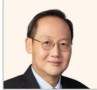
Dr Tan See Leng

Minister for Trade and Industry Singapore