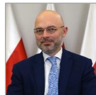
H.E. Michał Kurtyka

Secretary of the Department of Energy Republic of the Philippines