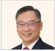
Gan Kim Yong

Minister for Trade and Industry Singapore