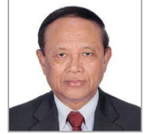
H.E. Dr Ith Praing

Minister of Energy and Mineral Resources Indonesia