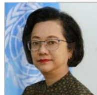
H.E. Armida Salsiah Alisjahbana

Deputy Executive Director International Energy Agency (IEA)