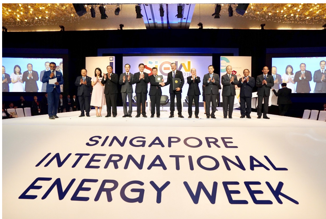
Stage (Photo Line Up)