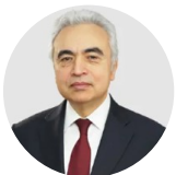
Fatih Birol Executive Director International Energy Agency